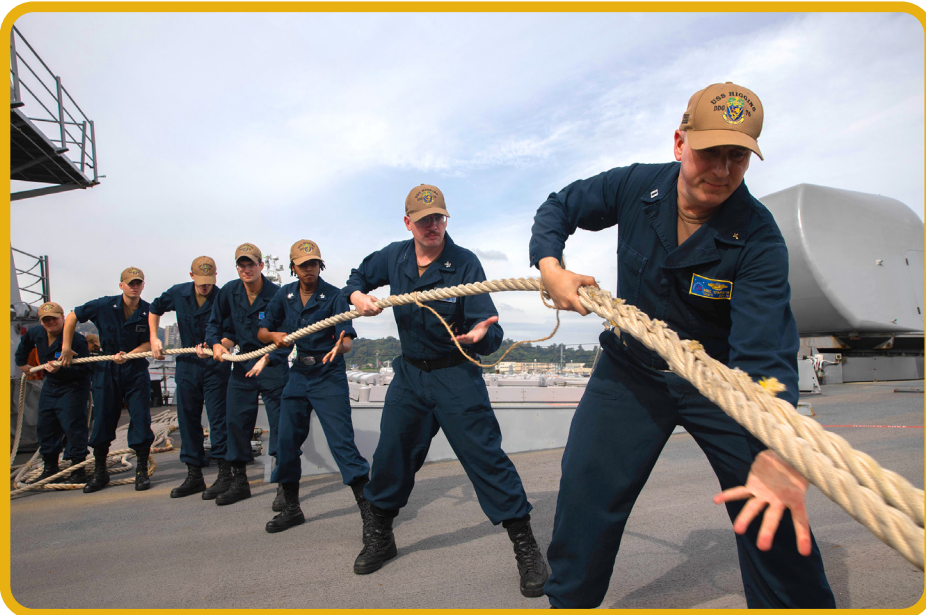
Sailors mooring on the USS HIGGINS