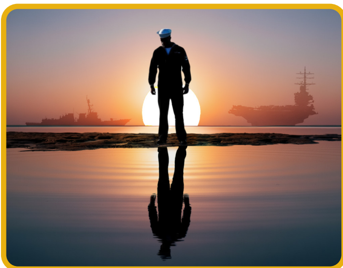
A Sailor looking at their reflection with ships at sea

Setbacks can come from many angles such as ending a relationship, failing to get a promotion, or not reaching a milestone. When these challenges arise, a Sailor's Warrior Ethos, a key component of their overall spiritual readiness, provides a crucial foundation. A strong sense of identity and character grounded in Warrior Ethos enables them to get back on track.