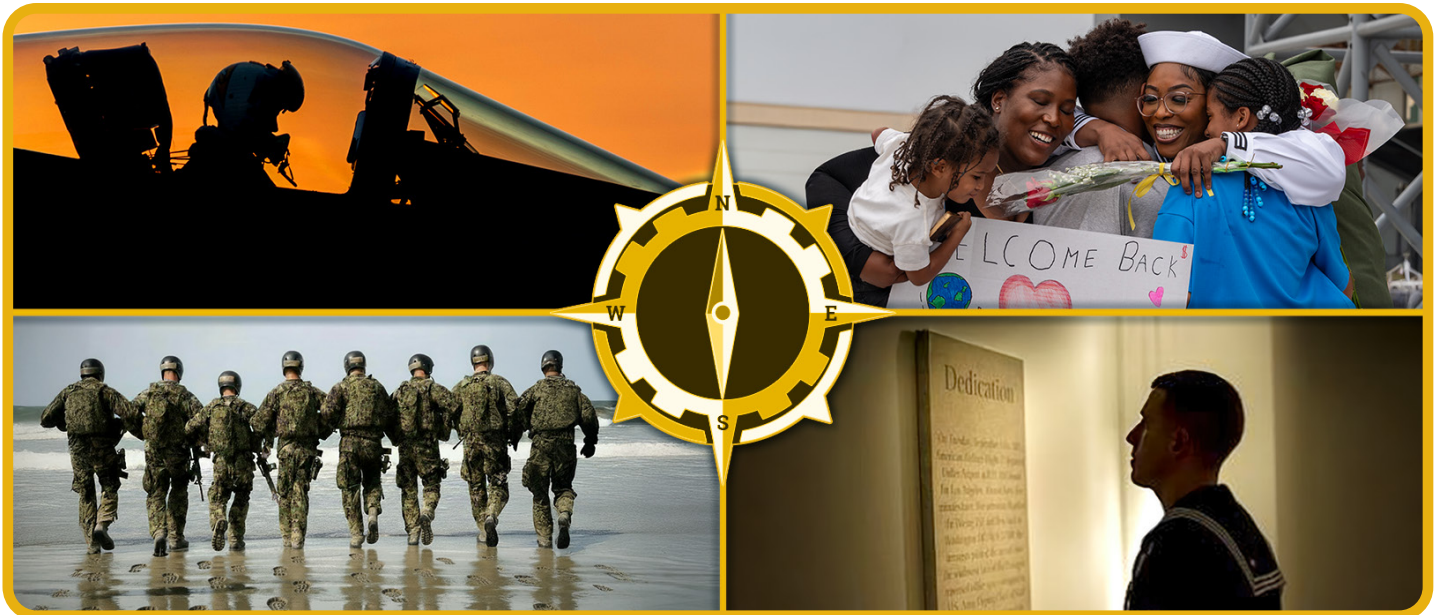
Sailors practicing Warrior Ethos through service, family, teamwork, and dedication

strength and resilience. Through rigorous training, the fighting Spirit of Sailors, and the steadfast support of families, the Navy sustains a culture of warfighting excellence and hones its ethos: Sailors do not give up the ship, they never give up on their shipmates, and they never give up on themselves. They are never out of the fight.