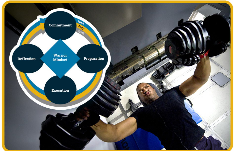
A Sailor weight training next to the Warrior Mindset model

The Warrior Mindset can only be effective if each domain includes the